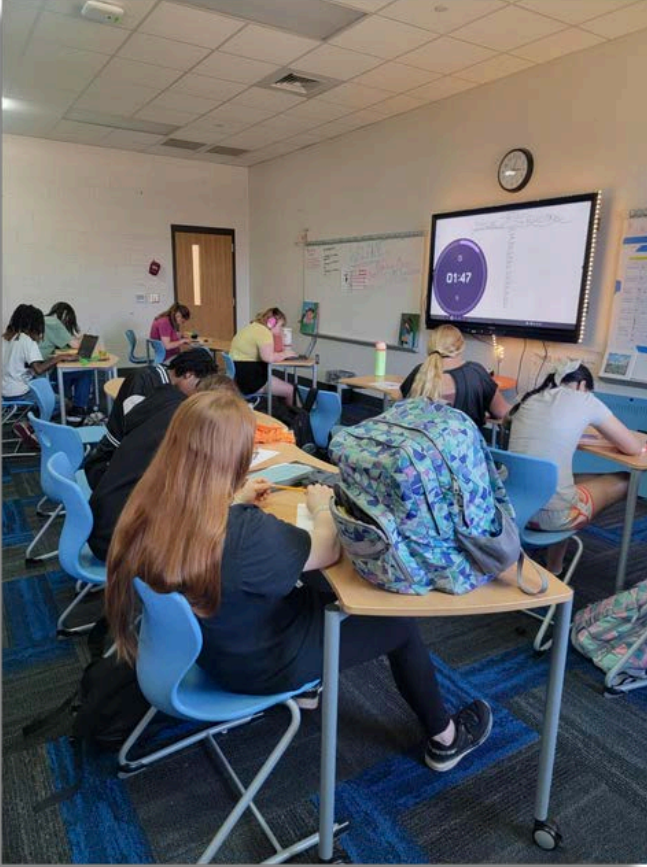
Above: Camp Road Middle School students participate in an activity during a visit from our outreach team.

This spring, our outreach team remained active across Charleston County, meeting voters at major events and community programs. We attended some of the season's most popular gatherings, such as the Charleston Black Expo, the MUSC Senior Expo, and the Blessing of the Fleet & Seafood Festival!