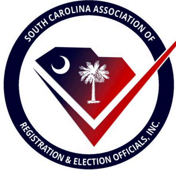
Above: The logo for the South Carolina Association of Registration and Election Officials, Inc. is shown.

For more information on SCARE and its efforts to support election officials statewide, visit scarenews.org .