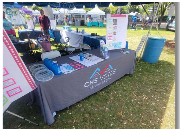
Right: A table with giveaway items, forms, and other resources is set up at the Blessing of the Fleet & Seafood Festival.

And as we head into summer, our outreach will remain visible at libraries, community centers, and neighborhood events to ensure every resident has the tools they need to vote with confidence. Are you interested in having our team come to you? Reach out to us on our website!