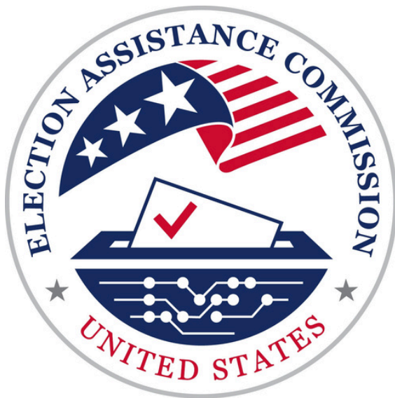
Below: The U.S. Election Assistance Commission's logo is displayed.

The department also earned top honors for Accessibility, thanks to the launch of its Voter Accessibility Advisory Committee (VAAC). This committee brings together advocates and community members to improve voting access for residents with disabilities, ensuring that all eligible voters can participate in Charleston County elections.