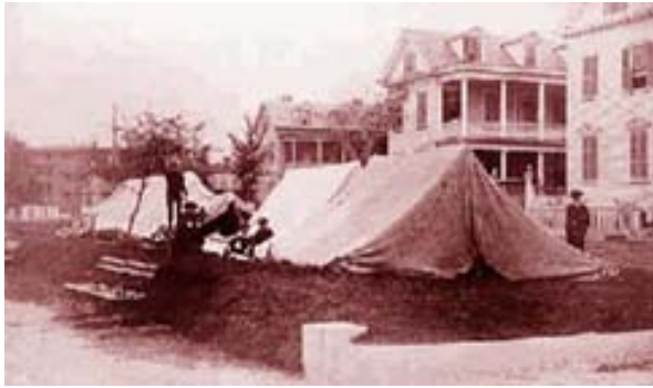
Photo: Tent City after Charleston Earthquake of 1886.