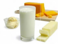
Dairy products (milk, cheese, yogurt)