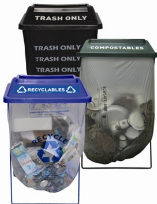
ClearStream® bins come with folding frames, bags and labeled lids.

The number of attendees at an event affects the amount of waste generated. This table is a helpful guide that can