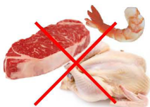
No raw meat products (beef, poultry, pork, seafood)