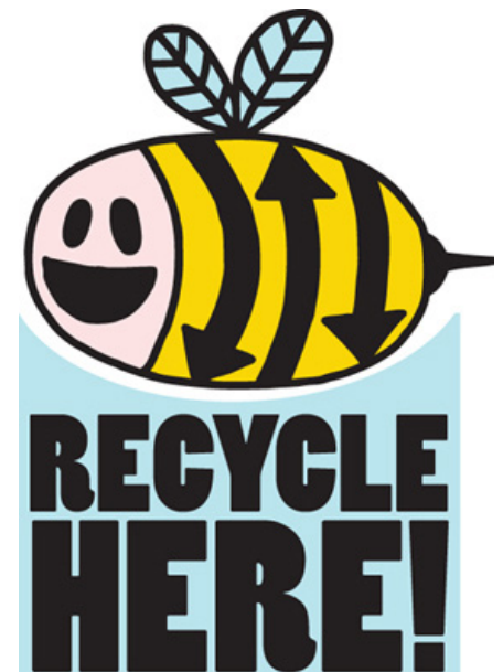
Large, colorful signs with text and graphics effectively communicate how to properly sort waste at events.