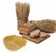
Bread, dough, bakery items, pasta and grains