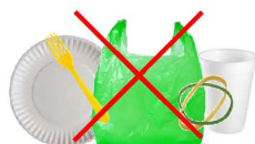
No plastic bags, serve ware, utensils, twist ties, rubber bands