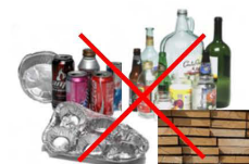
No wood, metal, glass or other non food items