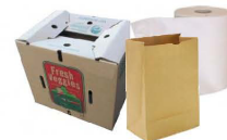
Food soiled paper: paper bags, paper towels, and paper napkins; and waxed cardboard boxes