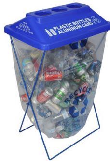
ClearStream® bins are available for collection of recyclables generated at events.

The County will loan bins to community groups, nonprofit organizations, businesses and citizens who plan to collect recyclables and/or food waste generated at events held within Charleston County. The special event recycling program provides equipment for on-site collection of materials. In most cases, event organizers are responsible for hauling collected recyclables to a Charleston County recycling dropsite . Larger events may qualify for a collection service by Charleston County.