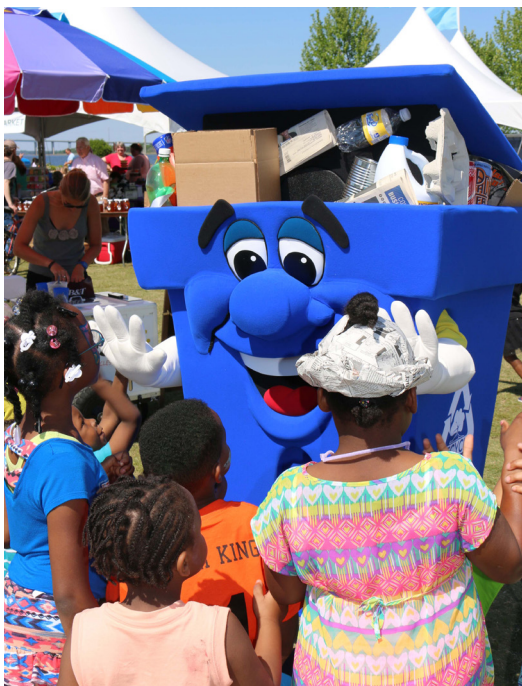
Charleston County's recycling mascot, Phil D. Bin, at the County's Annual Earth Day Festival.

This guide is intended to help event organizers plan for the collection of recyclable materials.