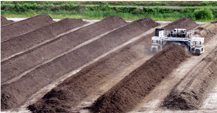
Charleston County’s Bees Ferry Compost Facility

Charleston County offers ClearStream® compost collection containers and compostable bags for free of charge (with a refundable deposit). Food waste haulers will charge a service fee to cover their labor costs and tipping fees at the compost processing facility. For fees and service options, contact the food waste haulers directly. Ask if the hauler will consider waiving their fees in exchange for sponsorship recognition or find a third party sponsor to help cover the costs of composting.