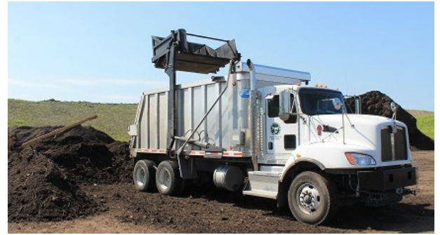
Food waste haulers bring collected compostable materials to the County’s compost facility for processing.

Transportation of the collected compostable materials to the County’s composting facility must be arranged in advance. For smaller events generating a limited amount of food waste, the County encourages self-hauling of the material from the event site to the Bees Ferry Compost Facility (1344 Bees Ferry Road, Charleston, Hours: Monday - Friday, 8 a.m. to 4 p.m. and Saturday, 8 a.m. - 3 p.m.). For larger events, contact a private food waste hauler to inquire about pricing to transport your organic material. Charleston County Government does not collect or haul food waste directly, but has collection partners listed below.