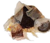
Coffee grounds and tea with filters