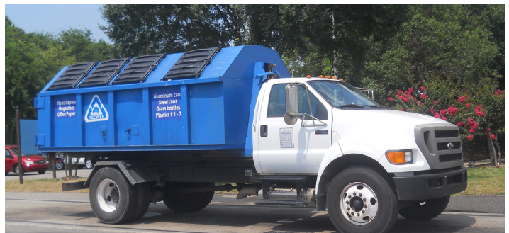
Larger containers are available for events with more than 1,000 projected attendees for collection of recyclable material.

Events with more than 1,000 projected attendees may qualify for a larger collection container to be used in conjunction with the ClearStream® bins and serve as a behind-the-scenes storage area for collected recyclables. These larger collection containers are delivered and picked up by Charleston County for no charge. Not all events qualify and this equipment is limited, so please contact CCEM before including this in your recycling program plan.