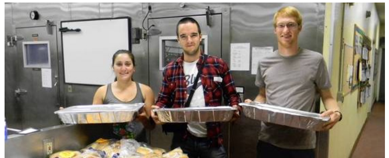
Volunteers pack-up catering leftovers for donation.

Food shows, banquets, and similar events often generate significant amounts of leftover, edible food and other items that can be donated. Contact food banks or similar agencies in advance of the event to find out what items are accepted and how they should be collected.