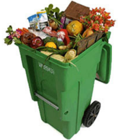
Composting at your event diverts food waste from the landfill and turns it into a nutrient-rich soil amendment.

Establish a food waste diversion goal and budget. Next, determine the best way for your event to divert food waste. Consider collecting unserved food and other usable items for donation to food banks or soup kitchens in addition to composting food scraps, soiled napkins, and used compostable serve ware. Work with food vendors to predetermine the types of food waste, serve ware, and packaging likely to be generated. Inform food vendors about food waste diversion expectations and encourage the use of compostable serve ware. Ask vendors to help spread the word to patrons about what materials can be composted.