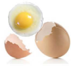
Eggs and egg shells