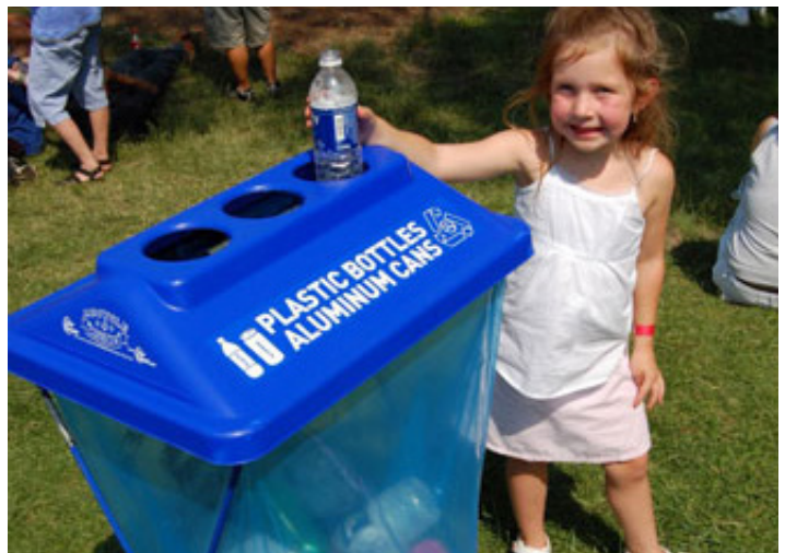
Transparent bags and labeled lids makes waste sorting easy.