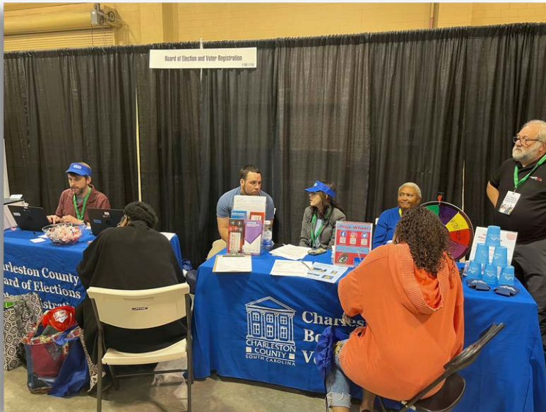
Above: Members of the Charleston County Board of Elections and Voter Registration assist Charleston County voters at the 2023 Black Expo

More photos from this year's event can be found on Page 8 .