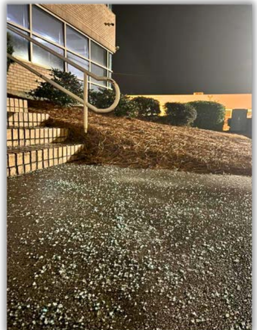
Above: Weather conditions quickly deteriorate at BVRE headquarters on Election Night.