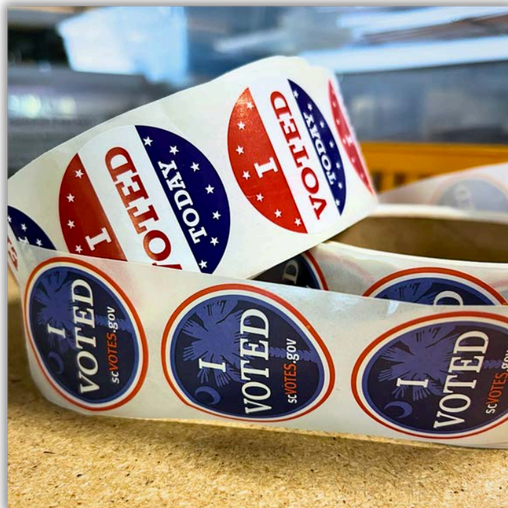
Above: Several "I Voted" stickers are pictured on rolls as they await voters.

To review official election results from this race, as well as from previous elections, visit CHSVotes.gov .