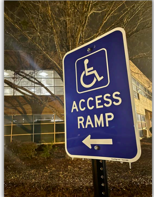
Above: Icicles begin to form on an "Access Ramp" sign at BVRE headquarters shortly after the close of polls on January 21, 2025.

Above all, we commend the resilience of our community, including voters who made the effort to cast their ballots despite the storm, poll workers who went above and beyond their duties, and the many individuals behind the scenes who contributed to the successful administration of this election under extraordinary circumstances. This election was a testament to the strength and determination of all involved, and we deeply appreciate the efforts of each person who helped uphold our electoral process