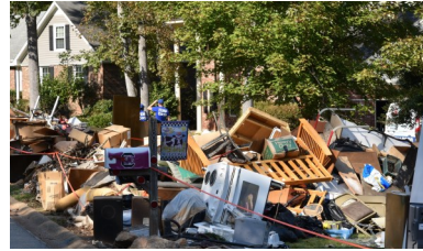
Don't let this happen to your belongings! Debris removal after Columbia, SC 2015 flood

Keep your valuable items elevated. If an item is particularly special to you, irreplaceable or too expensive to replace, keep it on a higher floor or elevate it off the floor on a shelf. Store items in plastic containers sealed with tape. Additionally, do not keep important belongings near windows or on the top floor of your home. A broken window or damaged roof can allow water into your home and ruin your belongings.