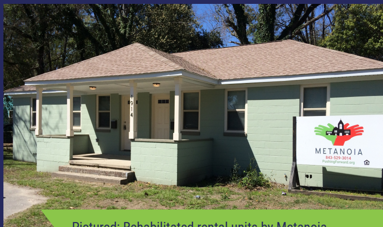
Pictured: Rehabilitated rental units by Metanoia