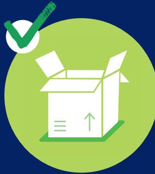
PAPERBOARD & CARDBOARD