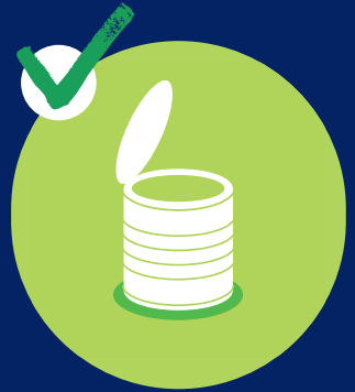
ALUMINUM & STEEL CANS