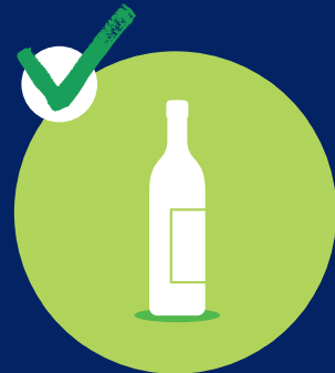
GLASS BOTTLE & JARS