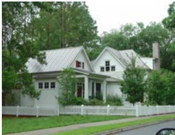
Demand for housing in the unincorporated County is mostly for single-family homes. However, accessory units like the one shown here offer affordable options in the more Rural Areas of the County.