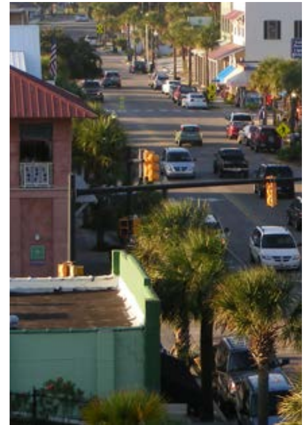
Coordination with both the large and small municipalities in the County is important in the long-term success of this Plan.