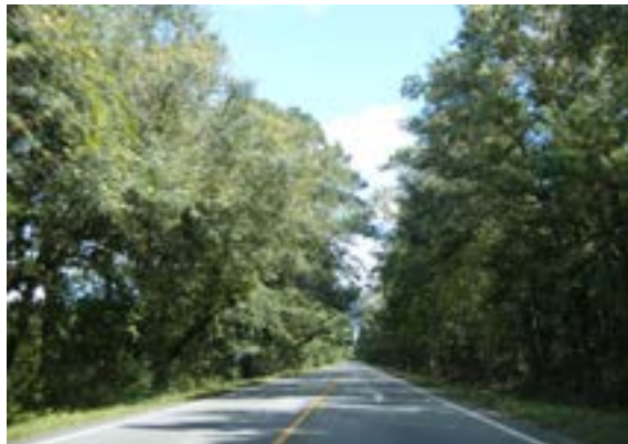
The scenic views along many of the County's roads are a key component to the vision and character of the County.

Following these introductory chapters, the Plan is divided into the Vision (Part 2), Comprehensive Plan Elements (Part 3), and Additional Resources & References (Part 4). The following lists the various