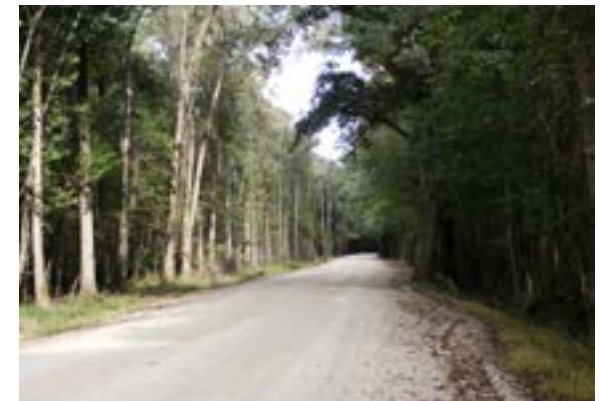
Charleston County has established communities, areas where development will take place, and areas that will remain in a natural state.