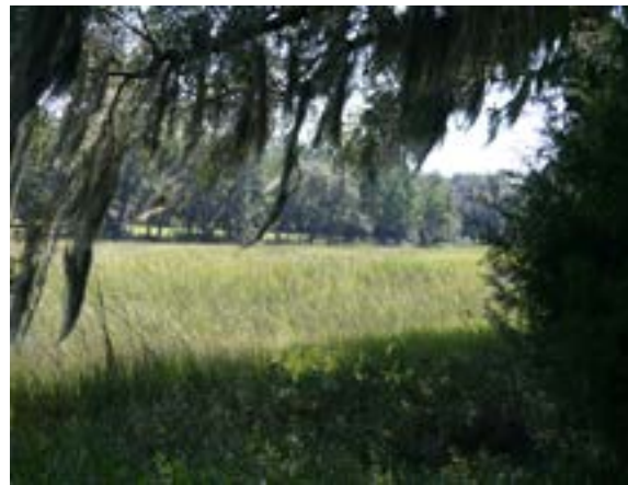
The County has adequate capacity to accommodate growth while still preserving much of the rural character. Current regulations go a long way to set appropriate development densities.