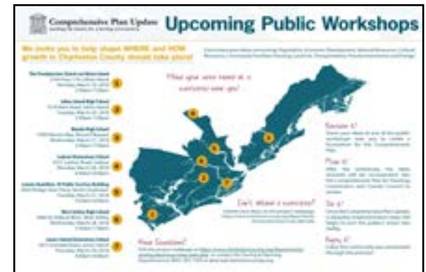
Pictured above is the flier used to advertise the public workshops held for the 2018 Ten-Year Update.