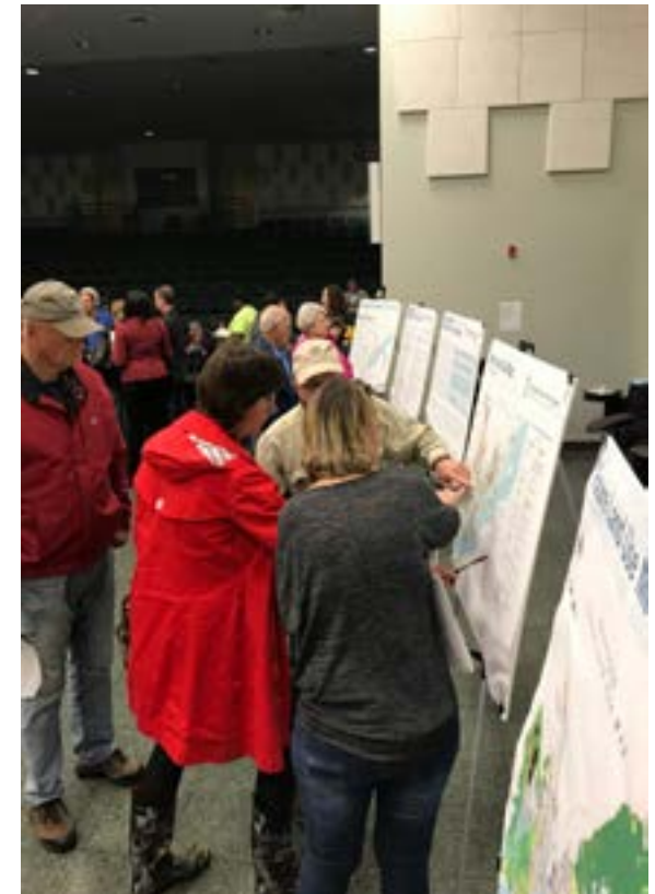
Public participation is key to updating the Comprehensive Plan.