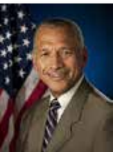
Major General Charles F. Bolden Jr. USMC (Ret.) Former NASA Administrator