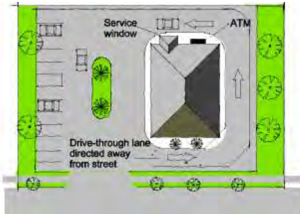
Figure 9.5.2, Drive-through Equipment